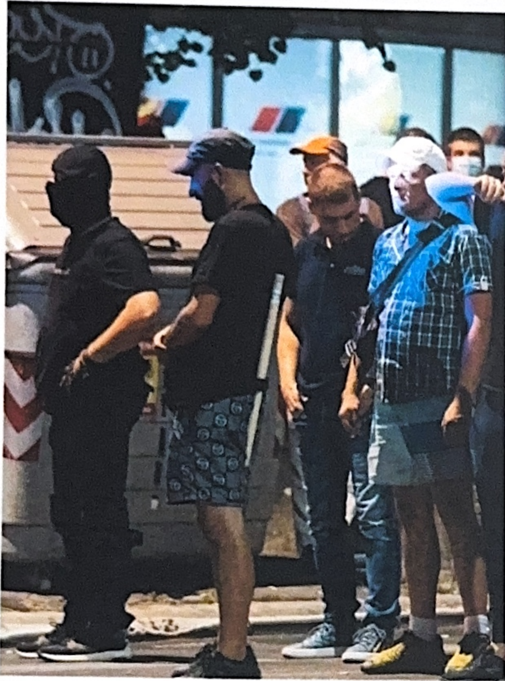
SNS party offices smashed and burned