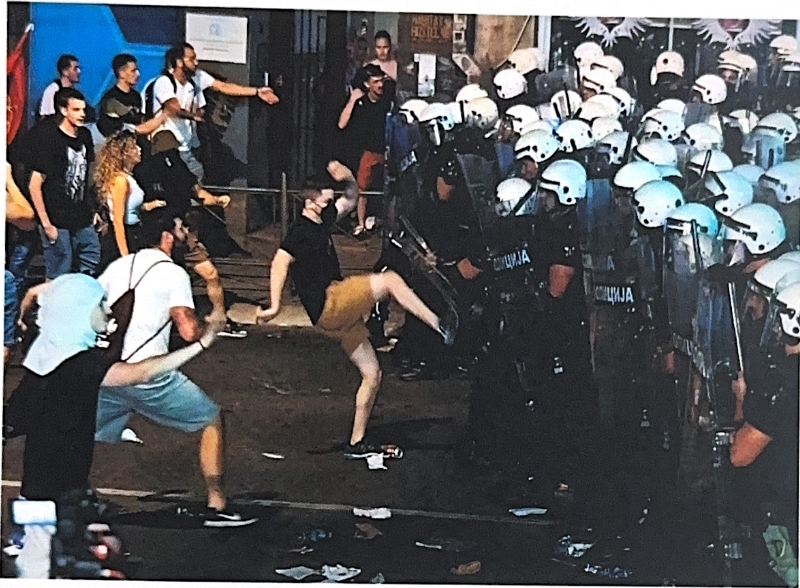
“Students” at the protest